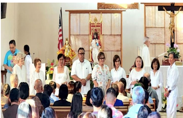
New Officers of the Marian Club who were installed on January 12th, for the Marian Club.

The funds collected from recycling is for the Altar Server Ministry.