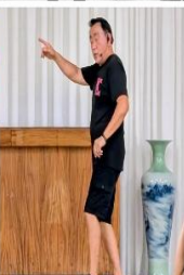
Mahalo for your support of the Zumba Fundraiser, Tuesday, April 7 for the Charity Walk. Join the next Zumba Fundraiser on April 21st

MAHALO WORSHIP COMMISSION, KNIGHTS OF COLUMBUS, OCIA & ADULT SACRAMENTS TEAM, LIFETEEN YOUTH MINISTRY, HISPANIC COMMUNITY, AND TO MANY VOLUNTEERS WHO HELPED BEHIND THE SCENES TO MAKE OUR LENTEN AND EASTER CELEBRATION A MEMORABLE, SPIRIT FILLED FAITH JOURNEY