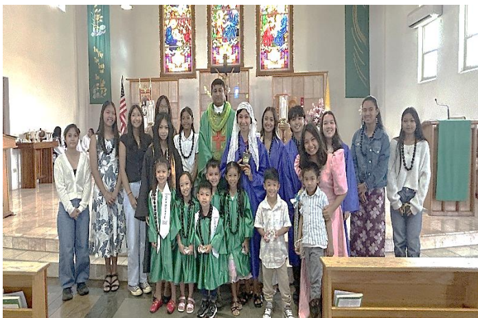
CLASS OF 2026 BLESSING OF GRADUATES CTK Child Development Center, Lihikai Elementary Iao Intermediate, Maui Waena Intermediate Kamehameha School Baldwin High School, Maui High School University of Hawaii – Maui Campus

O God, Lord of history and of every nation under heaven, we give You thanks for the 250 years since the founding of these United States. Look with favor upon this land which we love. Grant that its people may be guided by truth and charity. Bless all who serve in elected office. May they govern with integrity and humility. Strengthen families, renew communities, and heal every division that weakens our life together. We ask especially through the intercession of Mary Immaculate, patroness of these United States, that this nation may remain a land where human dignity is honored, where the weak are protected, and where hope is never extinguished. As we mark this 250th year, grant that we may recommit ourselves to life, liberty, and the pursuit of happiness in a way that is ever more just, more united, and more faithful to Your will. Through Christ our Lord. Amen